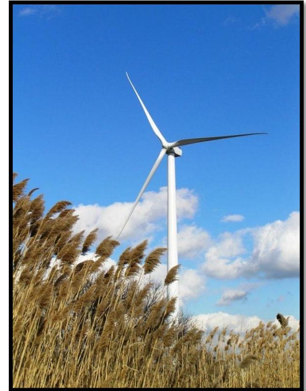
Jersey-Atlantic Wind Farm