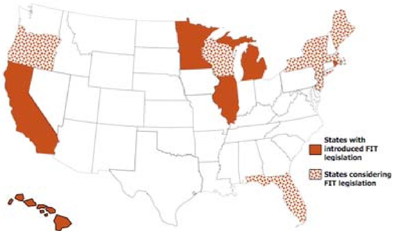
Figure 2: Status of State Feed-in Tariff Proposals in the US